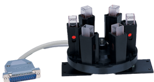
6 CELL AUTO CHANGER