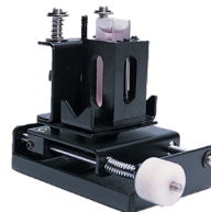
Adjustable Micro Cell Holder PART NO: 501-102

The CamSpec M209T has a large sample compartment that fits a selection of available accessories for automation and specific tests.