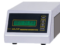
Peltier/Sipper System Combined PART NO: 501-124